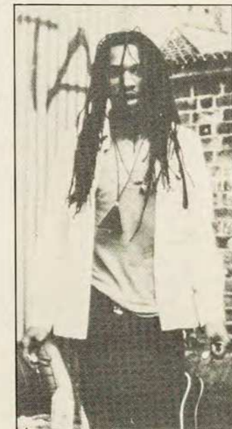
BENJAMIN ZEPHANIAH DUB RANTA (Radical poet) will be amongst the performers on the main stage, Hyde Park.

See them assemble for the march at Jubilee Gardens, 10.30am or in Hyde Park from 1.30pm onwards.