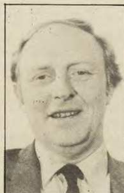
NEIL KINNOCK newly elected leader of the Labour party.

equal rights and justice. He is now President of the National Peace Council and the Anti-Apartheid Movement.