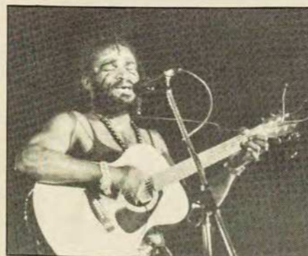
SPARTACUS R, performing on the main stage.

All day along the assembly area, the routes and in Hyde Park there will be peace floats, exhibitions, music, street theatre, giant puppets and banners.